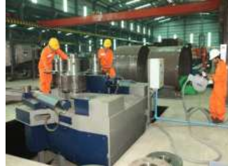
H-Beam Bending Machine