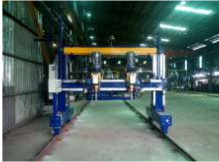
Box Beam Drilling Machine