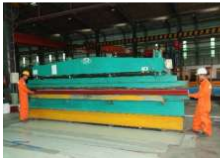
Roof Sheet Cutting and Folding Machine