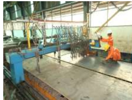
CNC Plasma Cutter