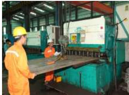
Hydraulic Press Cutting Machine