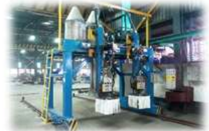
Root Pass Welding