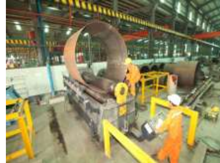
Plate Bending Machine