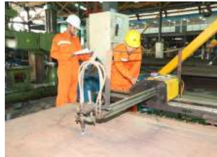
CNC Mini Cutter