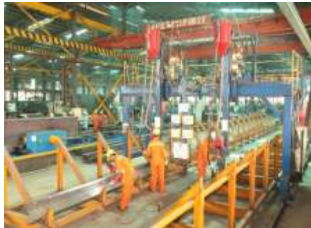
Sub-Arc Welding Machine