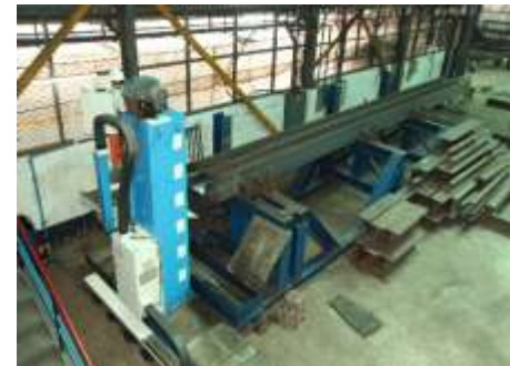
Face End Milling Machine