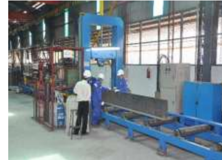
H-Beam Assemble Machine