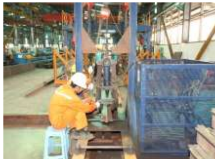
Flange Straightening Machine