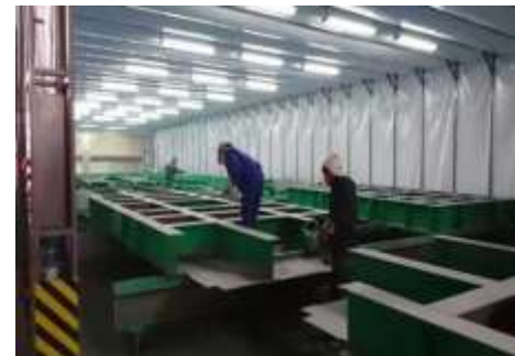
Flexible Painting Machine