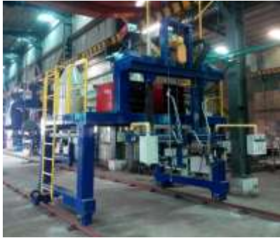
Electro-slag Welding Machine

All Kind Steel Structure Manufacturing, Construction and PEB Engineering.