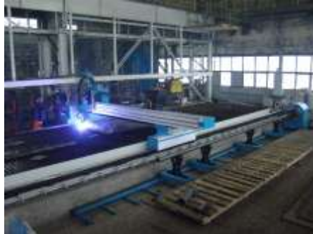
CNC Flame Cutter