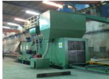
Shot Blasting Machine