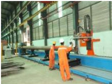
CNC Pipe Cutting Machine