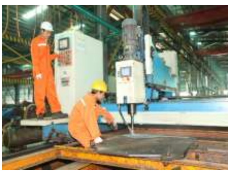
CNC Gantry Type Drilling Machine