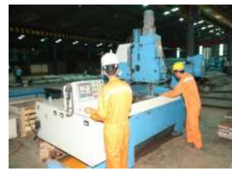
CNC Drilling Machine