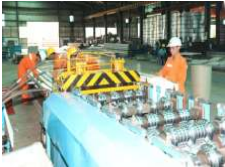
Decking Sheet Machine

All Kind Steel Structure Manufacturing, Construction and PEB Engineering.