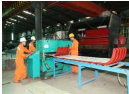
Roof Bending Machine

All Kind Steel Structure Manufacturing, Construction and PEB Engineering.