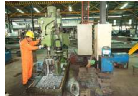
Radial Type Drilling Machine